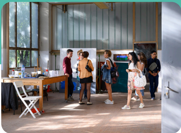
Moment from a meeting/cultural event involving partners and the local community

Here, accessibility means more than ramps and elevators: it is about spatial orientation, cultural openness, and enabling people to actively participate rather than remain passive visitors. The pilot will explore how digital tools can support these goals, from environmental monitoring to improved wayfinding.