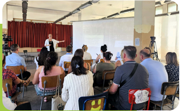
Moment from the visit of international guests during the “Mayors Speak” forum, taken on site at the Centre

The Centre is already attracting attention. In June 2025, during the “Mayors Speak” forum in Gabrovo, international guests, including urban sustainability experts from Poland, Azerbaijan, Spain, Czechia, Germany, Finland, Greece, and Slovakia visited the site. They were impressed by its history, potential, and the city’s bold vision for combining heritage reuse, culture, and accessibility.