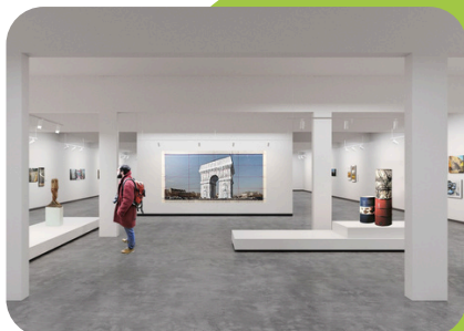
A glimpse inside the Christo and Jeanne-Claude Centre — concept rendering of its future spaces, ahead of the architectural competition

The redevelopment will turn the building into a multi-functional cultural and community space, bringing together a diverse range of uses under one roof. It will include adaptable event halls for performances, conferences, and public gatherings; exhibition galleries alongside educational rooms; and a specialised textile material library celebrating Gabrovo’s heritage in textile arts and manufacturing. Accommodation will be provided for artists-in-residence, while visitors and residents alike will be able to enjoy a café for informal meetings, a library for research and inspiration, and a gift shop offering locally crafted works and souvenirs.