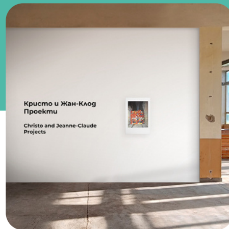
From an exhibition presenting the works of Christo and Jeanne-Claude