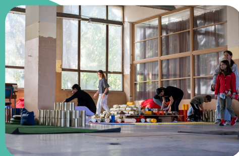
Scene from an art workshop held inside the building

The transformation of the Centre is part of the large-scale urban regeneration project “Shores of Contemporaneity – a set of measures under the Regional Development Programme 2021–2027”, approved in early August 2025 under the Integrated Territorial Investments (ITI) approach — a pilot mechanism in Bulgaria’s new territorial development strategy, supported by the EU Cohesion Policy.